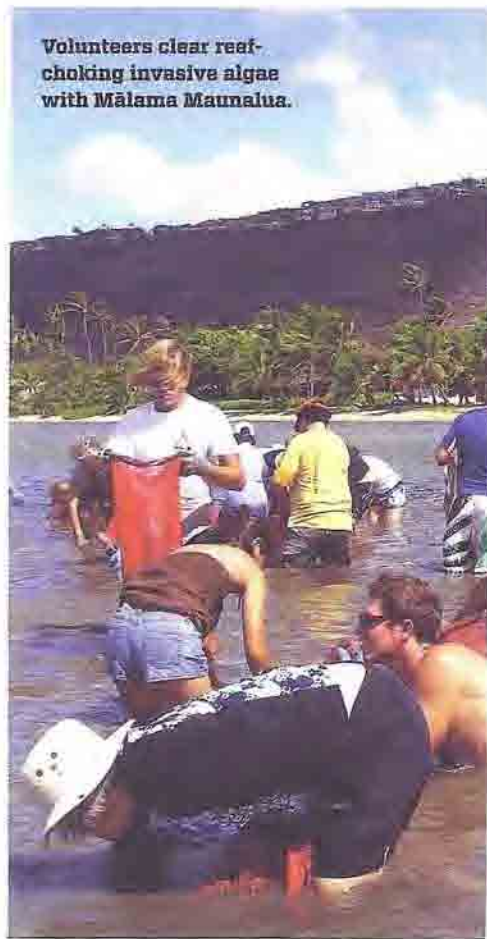
Volunteers clear reef-choking invasive algae with Mālama Maunaloa.

southeastern tip. Check out online calendar listings at www.hi.sierraclub.org/oahu . Participation is free for single-day projects, with no advance notice required.