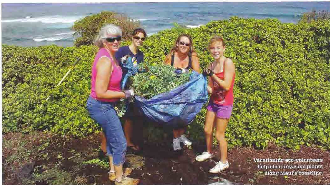
Vacationing eco-volunteers help clear invasive plants along Maui's coastline.